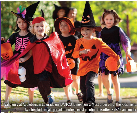
Valid only at Applebee's in Colorado on 10/31/23. Dine-in only. Must order off of the Kids menu. Two free kids meals per adult entrée, must mention this offer. Kids 12 and under.

Sponsorship space in this newsletter is extremely affordable! Reach parents in your local community & a significant portion of your investment goes back to the school! Want to sponsor this school? Please contact Rob Mangelson at Rob@tscacolorado.com or (720) 878-4107.